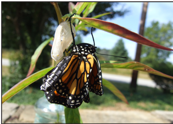
Newly Emerged Monarch

Adult butterflies feed on flower nectar and are not as specific about nectar plants as they are host plants. Butterflies are attracted to solid masses of color, flower fragrance, and flower shape.